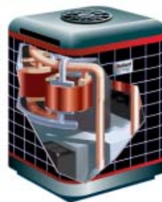
Residential fuel cells are a prime example of PATH technology scanning that paves the way for improved housing efficiency.

Did you know that you may soon be able to install a power plant in your own home?