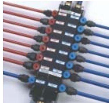
Vanguard Piping Systems, Inc.