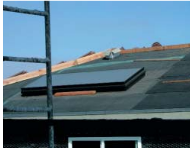
Photovoltaic roof panels are installed on a home built by Shea Homes in San Diego to increase the home's energy efficiency.

Together, PATH and Shea Homes are evaluating the latest technologies at work.