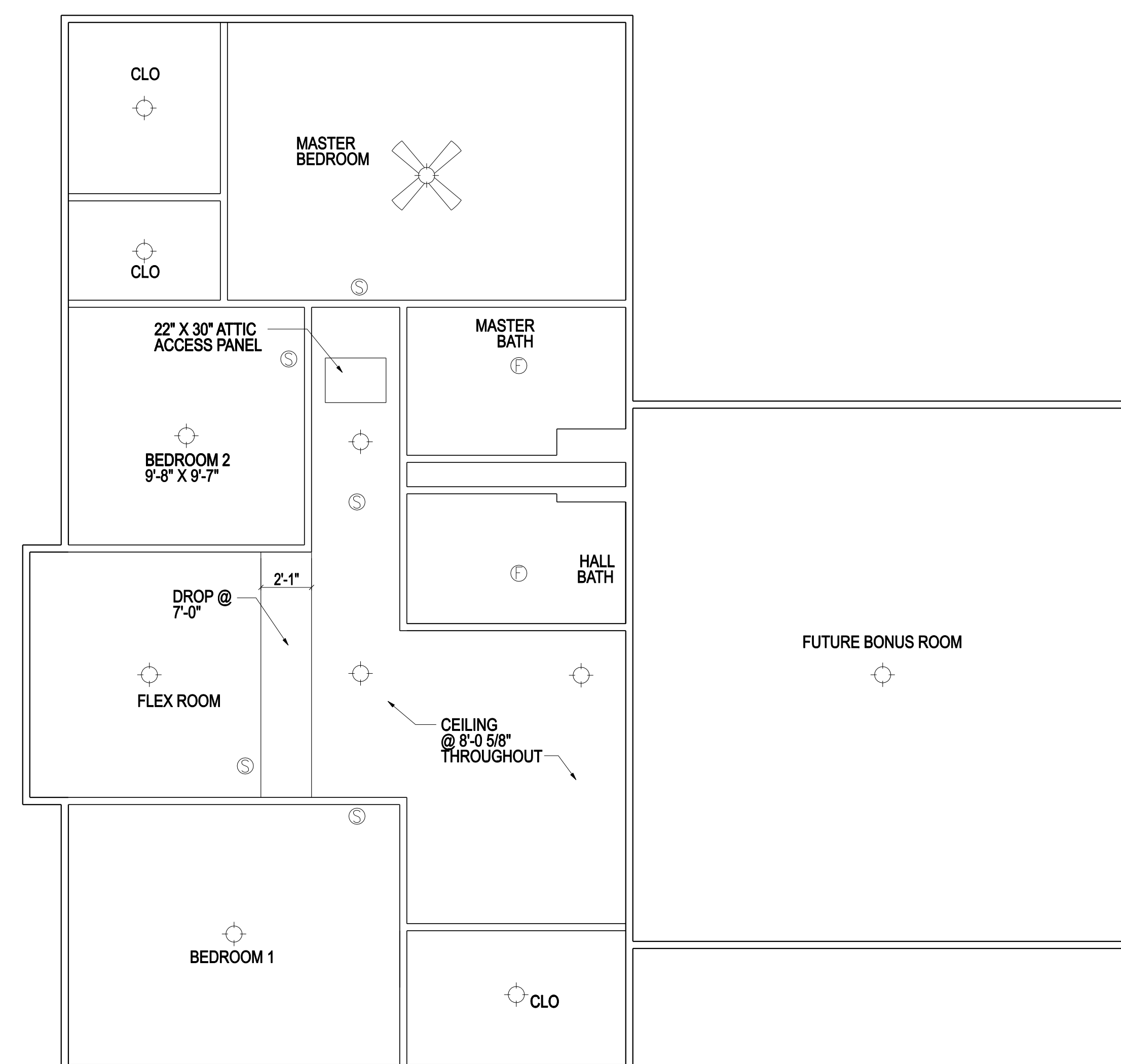
2 SECOND FLOOR REFLECTED CLG. PLAN 1/4"=1'-0"