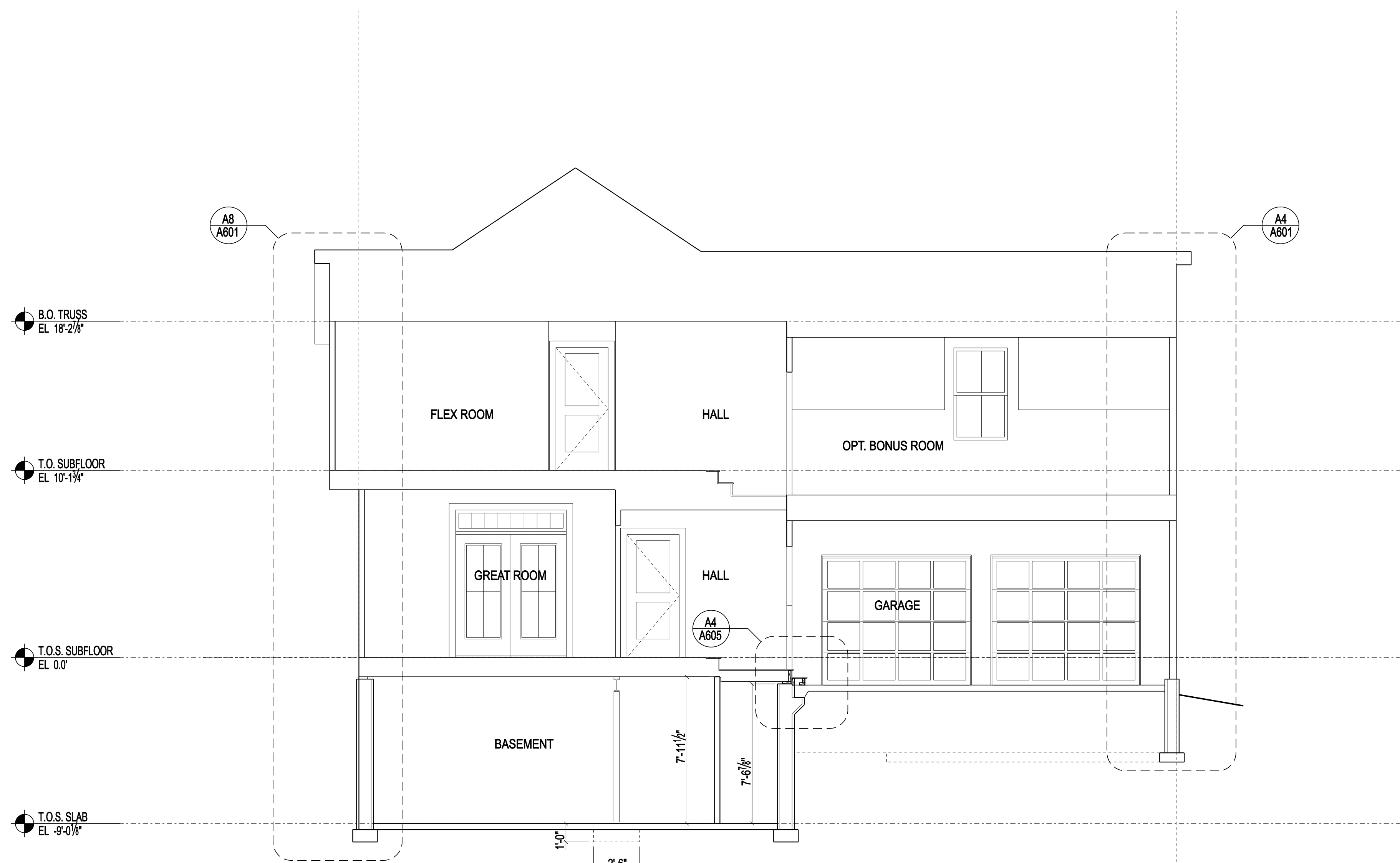
3 TRANSVERSE SECTION 1/4"=1'-0"