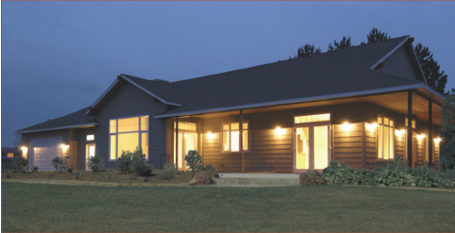
Home sweet home.